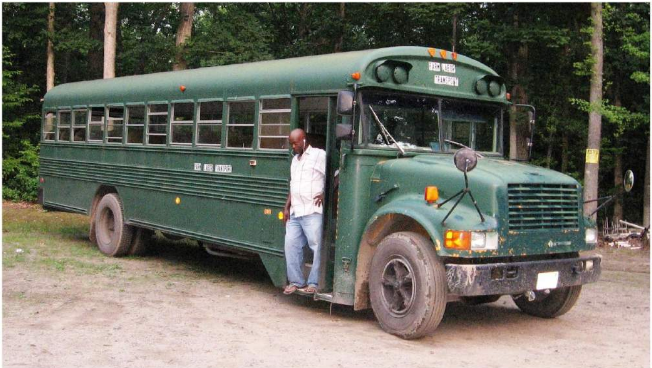
Farm labor bus, June 2011 , New Jersey Otobis pou fern travaye, jen 2011, New Jersey