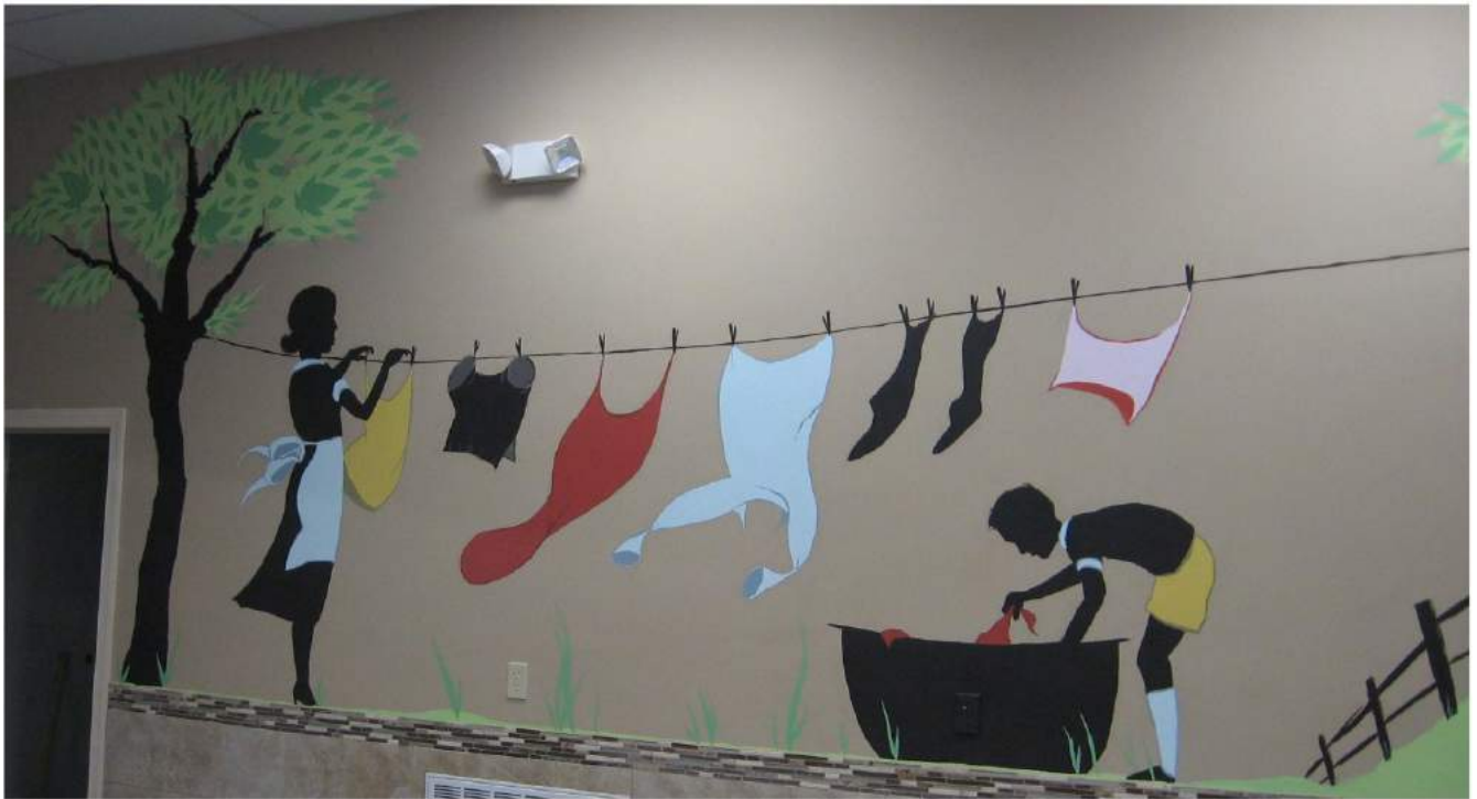
Mural at Rich & Al's Laundromat Miray atizay nan londwomat