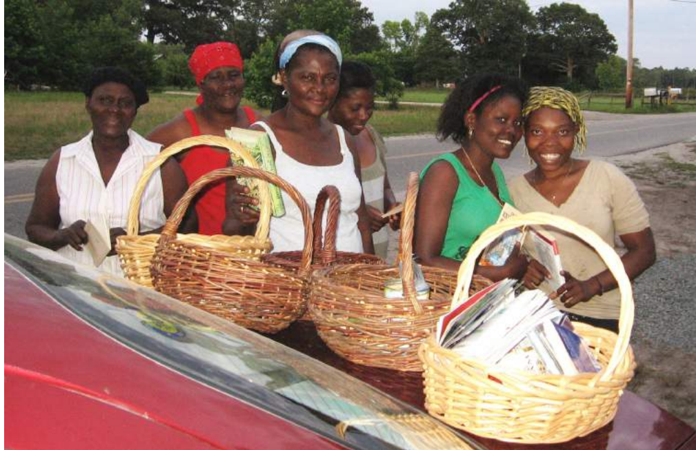
Haitian Migrant Worker Outreach, Baskets of books, June 2011, New Jersey Oganizasyon pou Travayè Ayisyen, panyen pote avèk liv, jen 2011, New Jersey